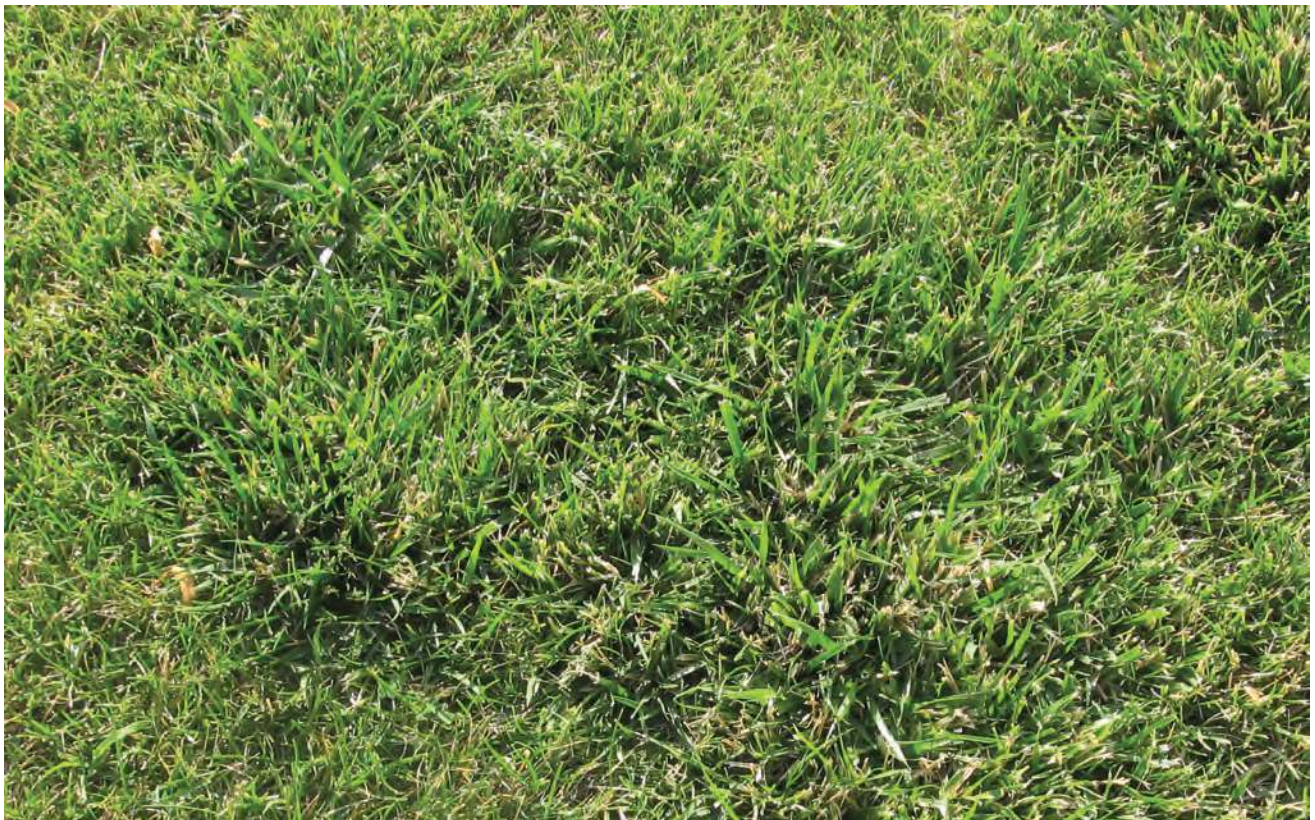
Figure 1. Although tall fescue is a desirable turfgrass species, it may be considered a weed if it infests a finer textured Kentucky bluegrass lawn.

or improper management. Weeds are opportunistic and readily become established in thin, weak turfgrass stands or landscape beds. Select and place plants that are adapted to the site conditions and will meet users' expectations and management requirements. If placed and managed properly, turfgrass and other landscape plants will cover and shade the ground, making weed germination and survival difficult.