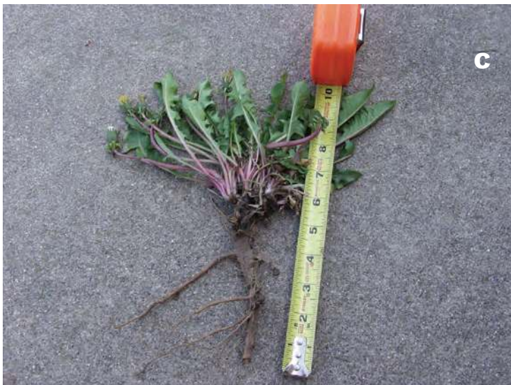
Figure 6. Weeds with stolons and rhizomes, such as ground ivy (a) and wild violet (b), are difficult to control via pulling because often the entire stem is not removed, allowing for regrowth. Additionally, wild violet is a prolific seeder. Weeds such as dandelion (c), with a deep taproot, need to be dug out 4 to 5 inches below the crown to prevent regrowth.