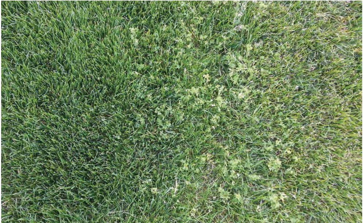
Figure 3. Weeds are good indicators of mismanagement. The left half of the photo shows a weed-free Kentucky bluegrass lawn managed with adequate nitrogen and water. The adjacent lawn, on the right, is managed with very little nitrogen and irrigation, and has a heavy infestation of yellow woodsorrel.