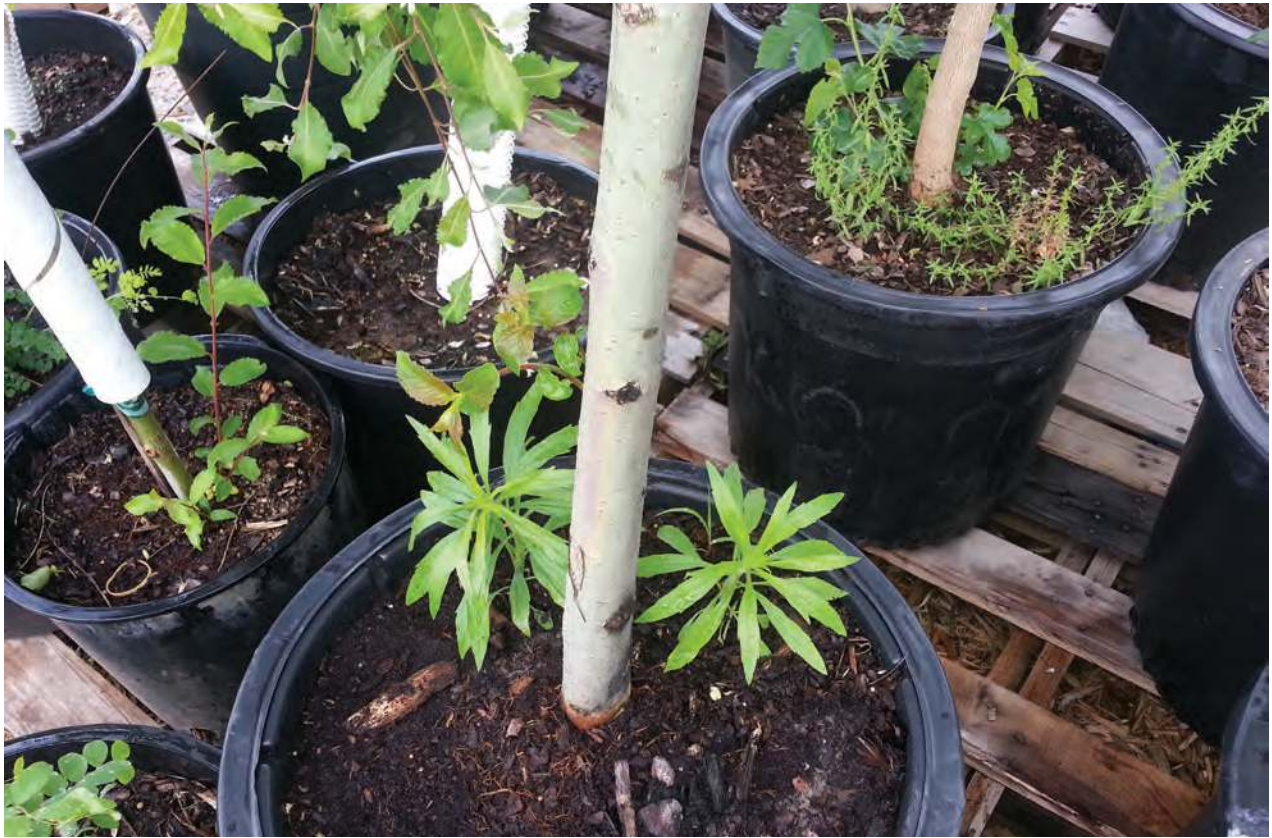
Figure 5. Weeds brought into a landscape from containers can quickly multiply and become a problem throughout the landscape.