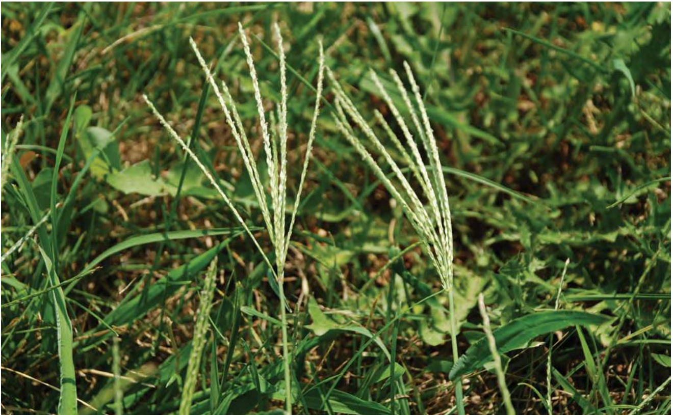
Figure 2. One crabgrass plant can produce 150,000 seeds per year. One year of not controlling crabgrass can result in many years of crabgrass problems due to the number of weed seeds available in the soil seedbank.